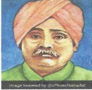
Lala Lajpat Rai

School ID – 1925273 CBSE AFF NO – 2730285 EXAM CODE – 25220